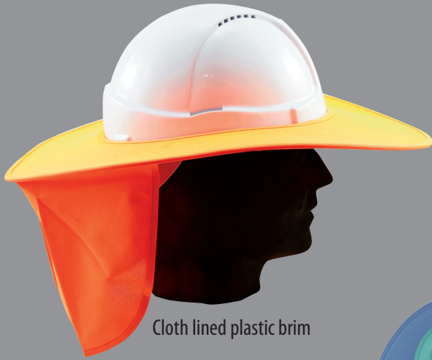
Cloth lined plastic brim

DURABLE AND STRONG WITH A TOUGH PLASTIC LINING ON ALL BRIMS