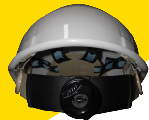
HMRH Replacment Push Lock Harness