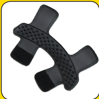
SMR701 - 2 wing