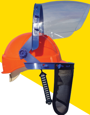
Visor Holder with Mesh or Face Shields Mesh and Face shields sold separately