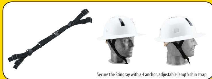
Secure the Stingray with a 4 anchor, adjustable length chin strap.