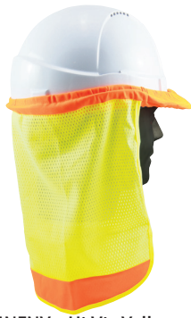
HMNFNY - Hi Viz Yellow with contrast Orange