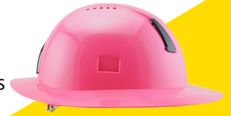
Designed in Australia, the Stingray helmet carries an Australian Patent and Design protection.