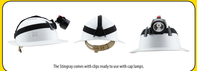
The Stingray comes with clips ready to use with cap lamps.