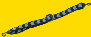
HMCS Chin Strap