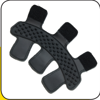
SMS601 - 3 wing