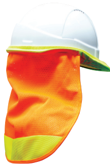
HMNFNO - Hi Viz Orange with contrast Yellow