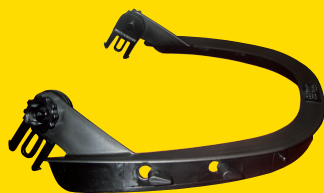
HMHV Visor holder