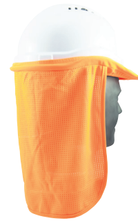
HMNFOO - All Orange

The high visibility neck flap provides you with great sun protection and helps to ensure you are protected whilst in the sun.